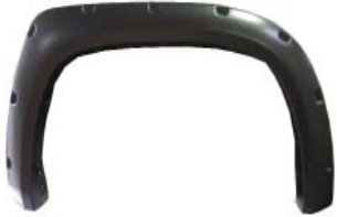
Driver Side x1