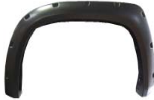
Passenger Side x1