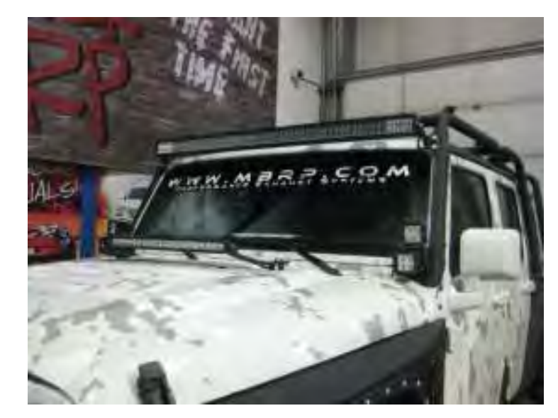
Congratulations! You're finished! We are sure that you will enjoy this Off Camber Fabrications product by MBRP In